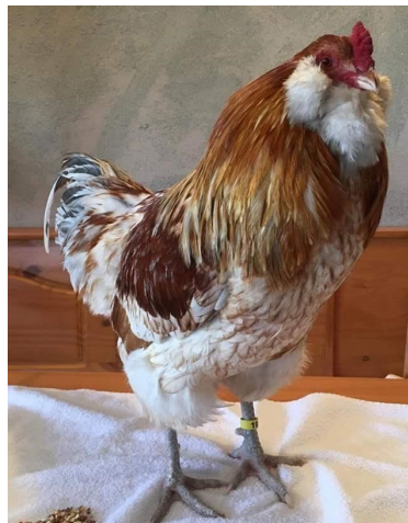
Nugget- young SW Cockerel